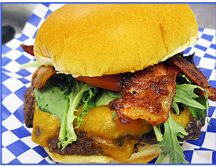
Premium Black Angus Burger with The Works

Gyro or Souvlaki Meat Platter Generous Portion of either meat Served 17 with Greek Salad, Hand-Cut Fries & Tzaziki.