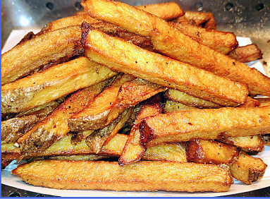
Fresh Hand Cut Fries

You Feta - Believe It! 11 Crumbled Feta, Greek Olive Oil, Oregano, Kalamata Olives and Made-to-Order Pita Chips