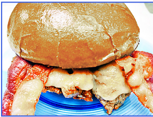
Grilled Chicken Breast Sandwich with Provolone and Applewood Smoked, Thick Cut Bacon

1/2 pound of Real, Certified & Tested PREMIUM Black Angus! 10 American, Cheddar, Provolone, Pepperjack or Swiss 1: Grilled Mushrooms or Grilled Onions 2 Make it a One Pounder! Add another Half Pound Pattie for 5 add Applewood Smoked Bacon 2