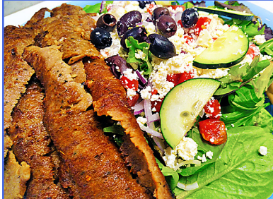
Large Greek Salad with Gyro Meat

REAL Greek Yogurt (made with Goats milk), topped with granola & honey 7 Spanakopita Spinach and Feta, Filo wrapped Pie 13 LA Smelts -Wild caught marinated & tossed in lightly Seasoned Flour & deep fried 9 Dolmathes “Stuffed Grape Leaves” Homemade with Seasoned Premium Black Angus and Rice, topped with Lemon Sauce & crumbled Feta 12