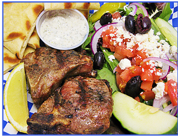
Grilled Lamb Chops with Tzaziki

Salmon Dinner “Famous Faroe Island Salmon” 24 Nicely seasoned 8 ounce filet & perfectly seared with Olive Oil, Rice Pilaf, light Greek seasoning & Fresh Lemon served with side Greek Salad & Pita