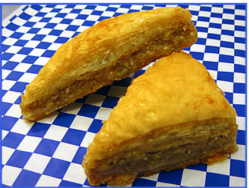
Homemade YiaYia’s Baklava